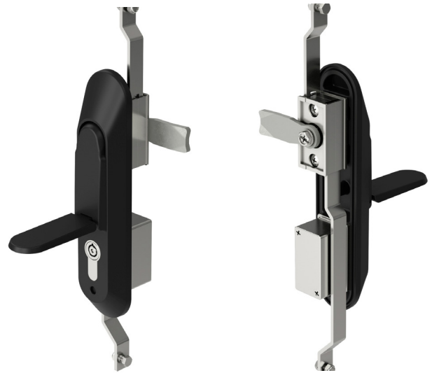
Single skin (409-1)