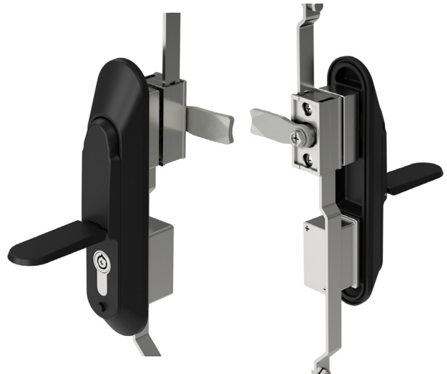
Double skin (409-3)